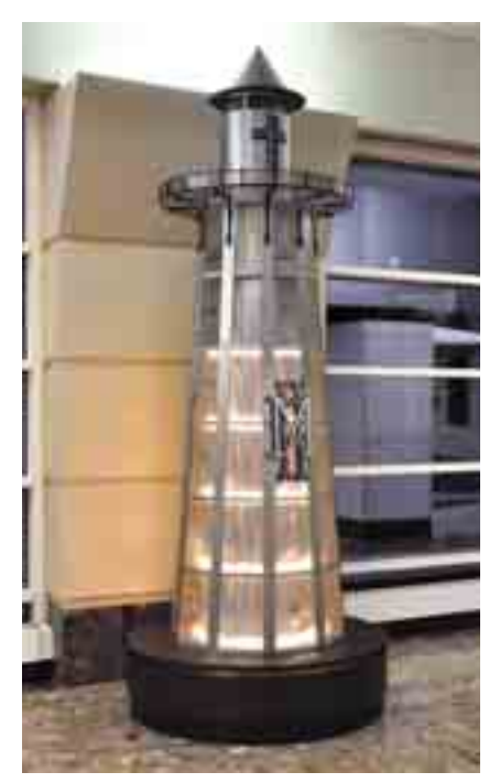
The beacon tote board lighted the campaign progress.

The employee campaign was so successful, with more than $2 million dollars pledged, that the general capital campaign co-chairs and the physician campaign chair each asked the foundation to make a presentation to their leadership, to share the accomplishments from the concerted effort of the employee campaign. They also wanted to enhance their campaign programs to make them more fun, like the employees' campaign. That's high recognition!